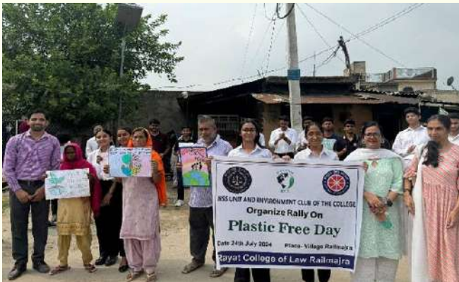
Rally on Plastic Free Day in the adopted village of Railmajra on 24th July, 2024