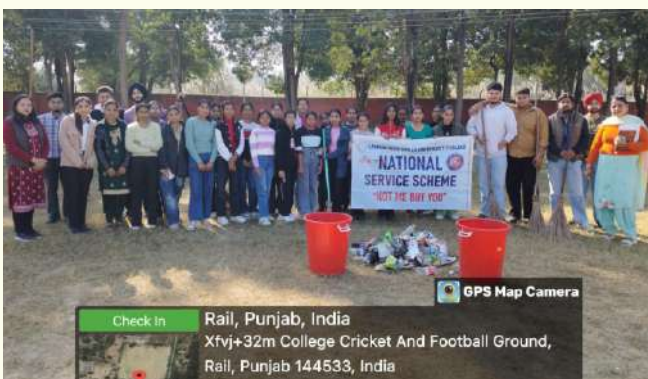
Cleanliness drive of University Ground and Hostel area 4th December 2024