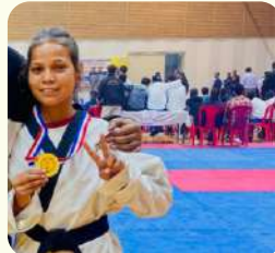
Bhateri Gold Medal