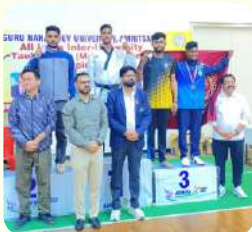
Anil Kumar Gold Medal