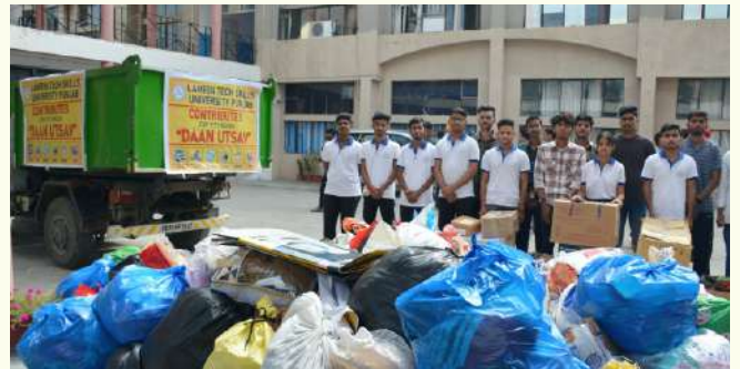
Daan Utsav- Donate Usable Items Drive 2nd – 8th October 2024