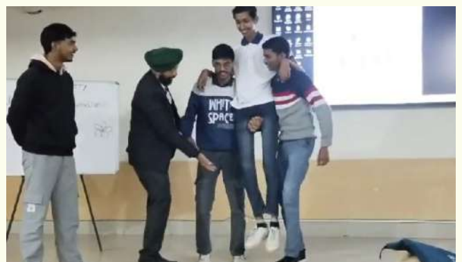
Workshop on awareness about First Aid 14th December 2024.