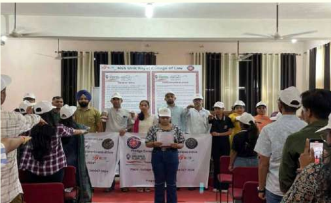
Pledge Ceremony and Cleanliness Drive on 1st October, 2024 under "Swachhata Hi Seva Campaign 2024"