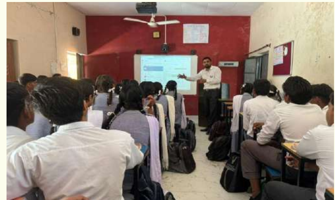
One-day educational drive on social awareness at Government Senior Secondary School, Railmajra. -30th August, 2024