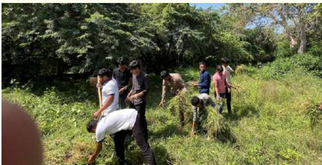
Cleanliness drive at Sirhind Canal Public Park 3rd October 2024