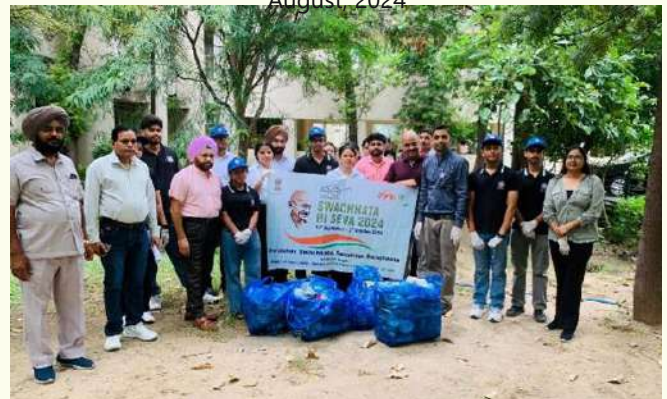
Experimental Learning Program & Cleanliness Drive at Civil Hospital, Ropar from 17th September, 2024 to 2nd October, 2024